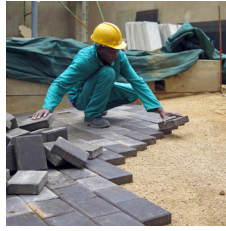
PAVING, KERBS & CHANNELS