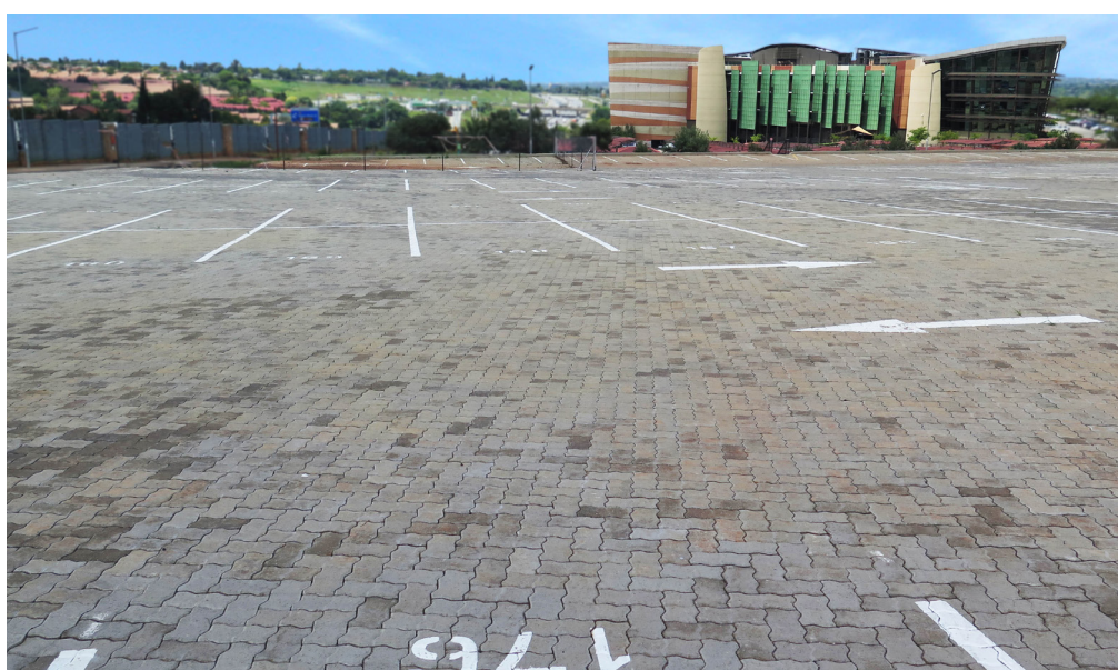
Left: Mondeor Substation in progress Top: FNB Fairlands Completed