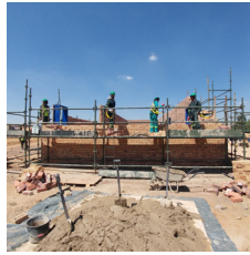
COMPLETE BUILDING CONSTRUCTION