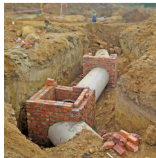
WE ALSO DO DEMOLITION, STORMWATER CONSTRUCTION, AND MAJOR SERVICES.